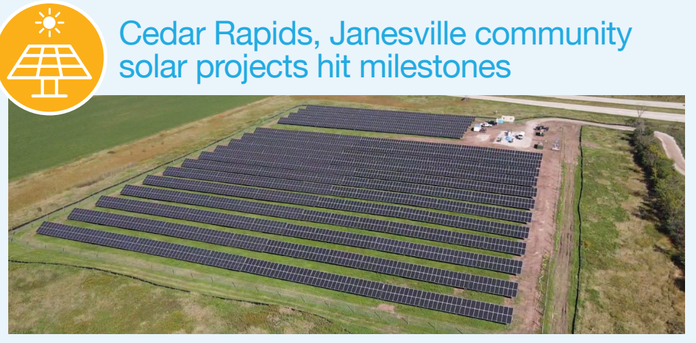
Our fully subscribed Fond du Lac Community Solar Project paved the way for our second project within the program.

To bring STEM to life for middle schoolers, we created a graphic novel series called the Power Chronicles. Kids (and adults) can join Akilah on magical journeys through time and space. In her first two adventures, she met women scientists of color from yesterday and today, and learned all about trees and ecosystems. In February this year, we released our third volume, "Akilah and the Quest to Save Power!" Get in on the fun at alliantenergy.com/powerchronicles.